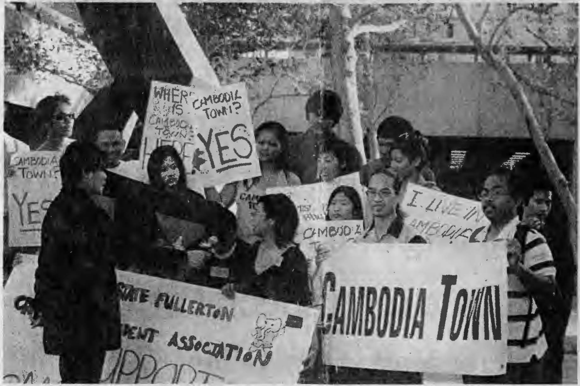
"WE ARE HERE FOR THE CAMBODIA TOWN" កូនខ្មែរ នៅតែជាកូនខ្មែរ! ទោះបីជាមានកំណើតនៅស្រុកគេក៏ដោយ ។ សិស្សានុសិស្សទាំងអស់នេះបានបង្ហាញនូវការគាំទ្រឲ្យមានភូមិខ្មែរ ។

First Cambodian Bilingual Weekly News | Volume 2 | Issue 70 | October 28th, 2006 | (562) 637-2381 Fax (562) 637-2380 | email: info@khemaraonline.com