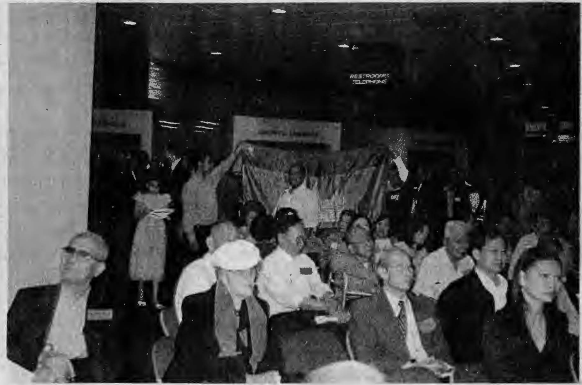
បងប្អូនខ្មែរទាំងចាស់-ក្មេង ទាំងអ្នកជនពិការ កំពុងអង្គុយរង់ចាំជាន់ជ្រាំម៉ោងនៅខាងក្រៅសាលប្រជុំដោយចិត្តអត់ធ្មត់។ Cambodian Americans and our friends, young and old, men and women, waited patiently for over five (5) hours out side the chamber.