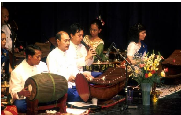
Image: Pin Peat orchestra

Cambodian music and musical instruments can be traced back to the time of the Angkor Empire (9 th -13 th C). Bas reliefs on the walls of the largest temples, Angkor Wat and Bayon, depict instruments very similar to those used in the modern ensembles.